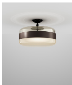
FUTUR PL G