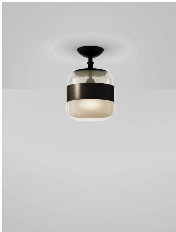
FUTUR PL P AMOT NE E27 CE